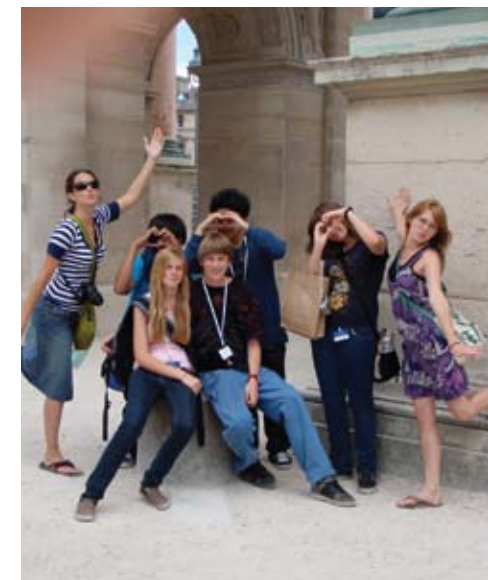
Teacher and students having fun at Notre Dame