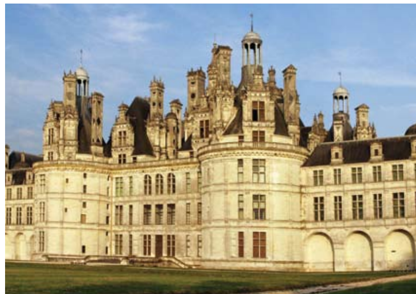
Château Chambord in the Loire Valley