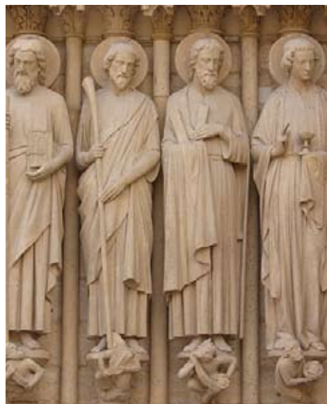
Carvings on the exterior of Notre Dame