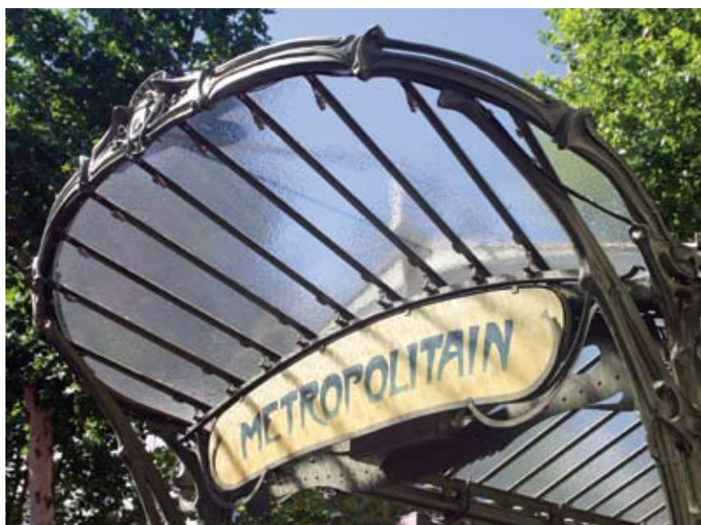
A regal entrance to the city's underground public transportation

Note: This itinerary may be modified depending on your travel dates, arrival and departure times, national holidays, and hours of operation in the host country. Prices vary depending on departure city and duration of program.