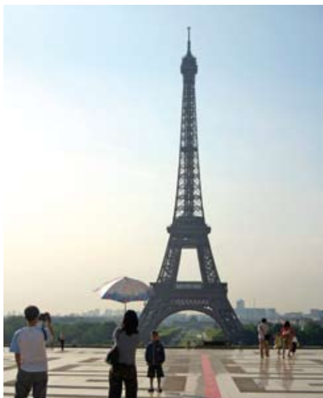
The Eiffel Tower, built in 1889 by Gustaf Eiffel

Bid farewell to this magical city with a final dinner of French cuisine .